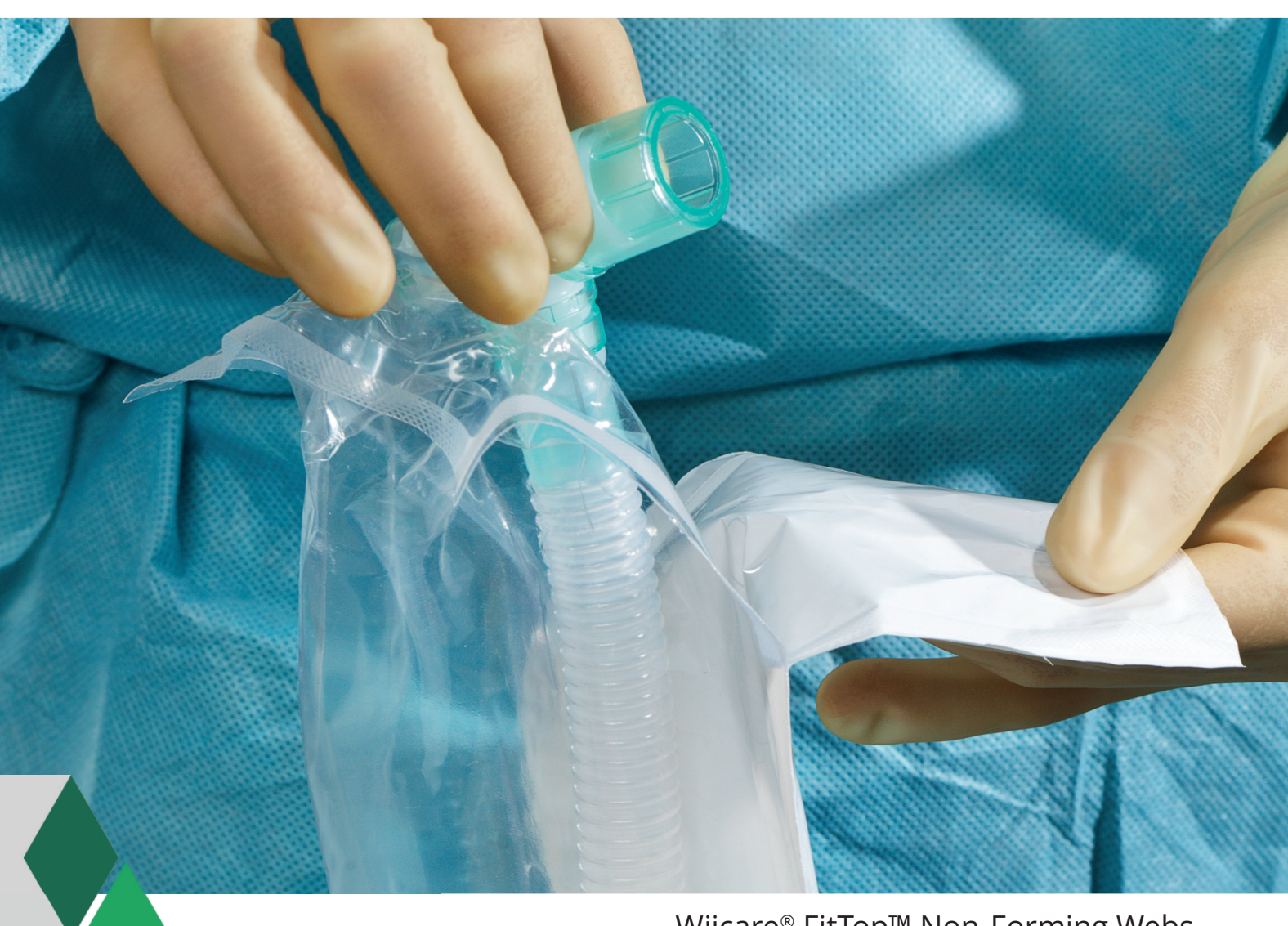
Wiicare® FitTop™ Non-Forming Webs